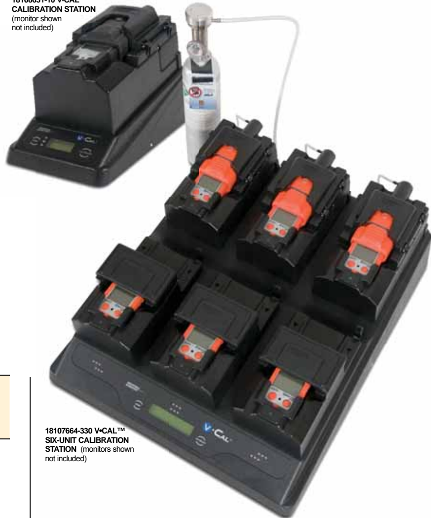
18107664-330 V-CAL™ SIX-UNIT CALIBRATION STATION (monitors shown not included)

Manually bump testing and calibrating gas detectors is a time-consuming burden for many organizations. The V•Cal Calibration Station simplifies these tasks, allowing users to initiate them with the push of a button.